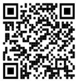
QR code to give via credit card now