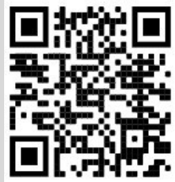
QR code for SOHSV.org Giving Page